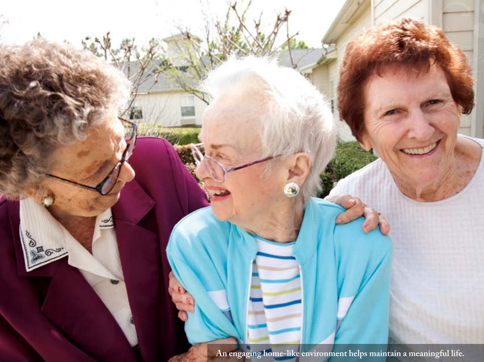
An engaging home-like environment helps maintain a meaningful life.